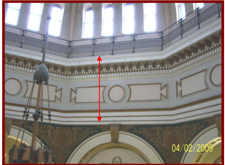
Above: What is known as the cornice in the Courthouse rotunda. This is the area that is scheduled for repair this spring and summer. The arrow displays the area that will be repaired.

In February 2009 the board decided to put the project out