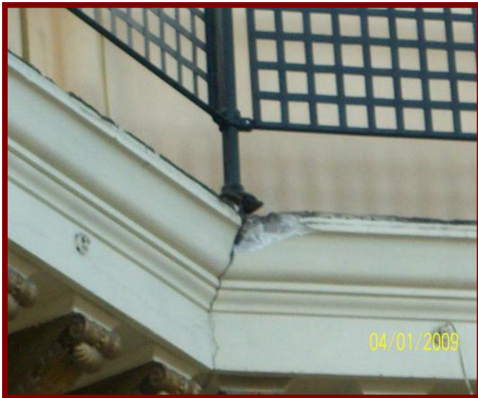
Above: A portion of the cracked and missing plaster below where the catwalk railing is attached.

for bid in the new budget year of 2009. On March 26, 2009 the Bradford County Commissioners awarded the bid for the cornice repair to Evergreen Paint Studios, Inc. of New York, NY., with a bid of $69,060.00.