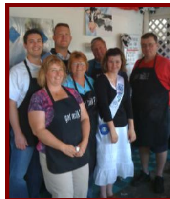
Serving Ice Cream at the Fair