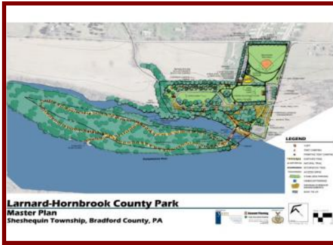
Above: Diagram of proposed changes for Larnard-Hornbrook Park.