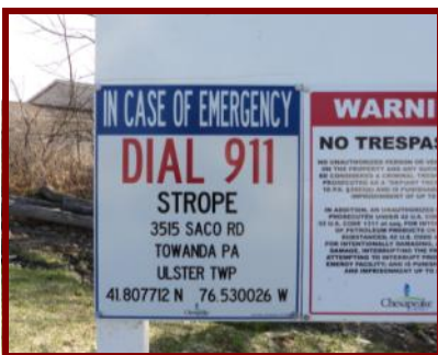
Above: 911 signs posted at natural gas well, compressor, and water withdrawal sites.

Bradford County Emergency Management has been working with natural gas companies to implement consistent signs for 911 response information. 911 addressing signs are being installed at natural gas related well sites around the county. In the event of an emergency, these signs are intended to give people the location information to give to