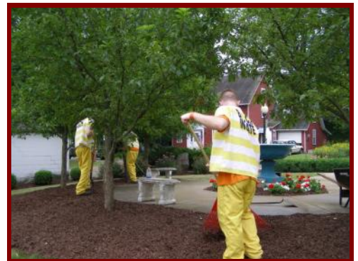
Above: Inmates on program working on a community park in Wyalusing Borough.

graffiti removal, various public works projects, special events, maintenance, or general public property clean-up. Bradford County inmates completed 9 jobs in 9 weeks with 992 hours of inmate labor. Communities served by the inmates include Ridgebury, Towanda, Rome, Wyalusing, and South Waverly.