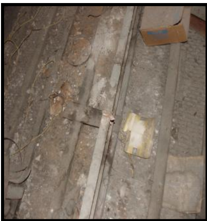
Left & Right: A view inside the dome. This is an open area that is between the interior and exterior. This open area houses the wench system that raises and lowers the large chandelier to allow for cleaning and replacement of light bulbs. As part of the repair and restoration this area will be professionally cleaned by the paint conservator.