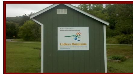
A sign on the garden tool shed displaying the Endless Mountains RC&D Council support for this community project.