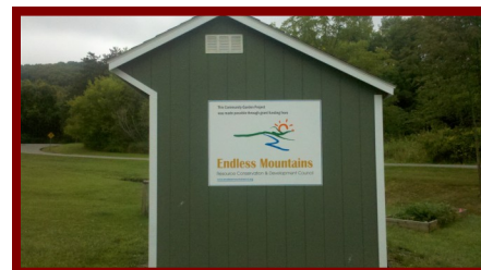
A sign on the garden tool shed displaying the Endless Mountains RC&D Council support for this community project.