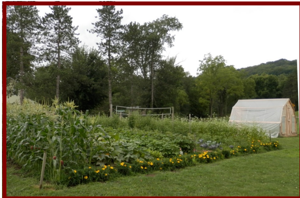
Above you will see the nicely maintained Healthy Kids Community Garden which is located down the street from the YMCA in Towanda. The reporter noted that there was not one weed visible to the discriminating eye.