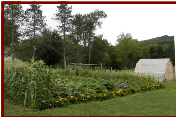
Above you will see the nicely maintained Healthy Kids Community Garden which is located down the street from the YMCA in Towanda. The reporter noted that there was not one weed visible to the discriminating eye.