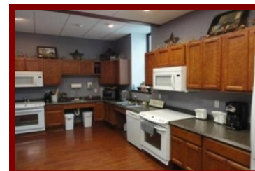
Chesapeake Café kitchen where the day campers prepped and cooked their food..