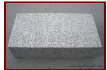
Above: Solid granite "Paver" available for purchase.