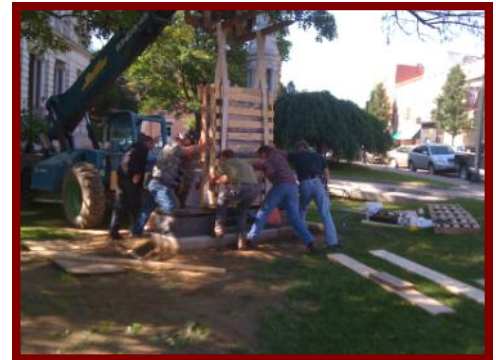
Top Right: The Memorial Stone, Bottom Right: Maintenance Department employees set the memorial in place, Left: Picture of new clock and memorial in front of courthouse