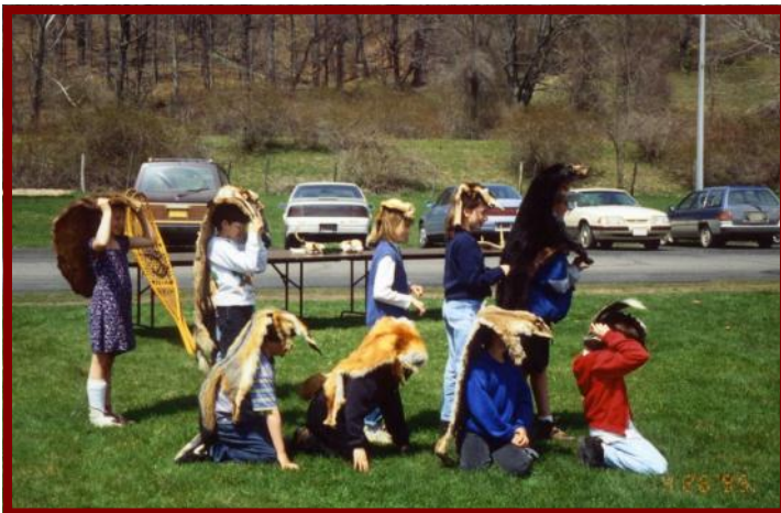
Children playing at Bradford County Field Days at Mt. Pisgah State Park