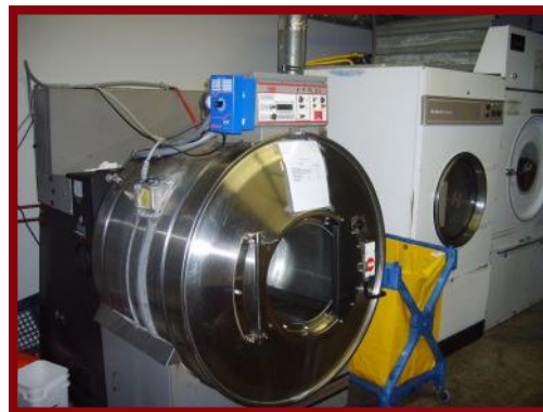
Right: Washer and dryer moved from the Manor to the Prison.