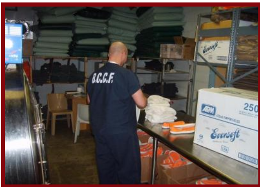
Left: Inmate folds laundry at the new laundry center at the Bradford County Correctional Facility.

begin the process of washing, drying and folding the laundry. The first shift of inmates begins at 12:00 a.m. and the second shift ends about 10:00 a.m. the next day. They process about 5-6 carts of laundry per night. Probably the biggest challenge faced by the jail was the logistics of getting the laundry back and forth and working out the details of times and transportation. It has been fully operational for over a month now and everything seems to be going smoothly. The manor predicts that this move will save them approximately $100,000 for the year.