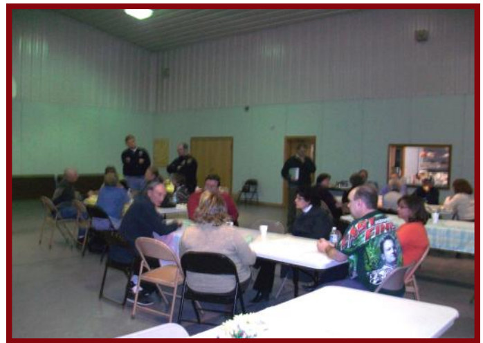
Break out session of community members at the recent town hall meeting held at First Baptist Church in Troy.

They were asked three questions regarding underage drinking. The first question was “What are our thoughts on underage drinking? They were given fifteen minutes to discussion and write their thoughts down. Some of the comments were: “A mess”, “rampant”, “socially acceptable”. The participants were then asked to move two more times during the evening to a new table with new people to discuss the other two questions. “Where are young people getting the alcohol”. Some answers that were given were “Friends”,