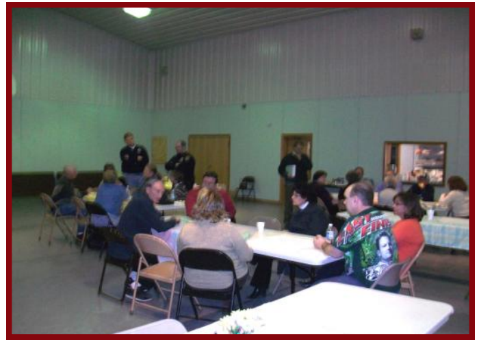
Break out session of community members at the recent town hall meeting held at First Baptist Church in Troy.

They were asked three questions regarding underage drinking. The first question was “What are our thoughts on underage drinking? They were given fifteen minutes to discussion and write their thoughts down. Some of the comments were: “A mess”, “rampant”, “socially acceptable”. The participants were then asked to move two more times during the evening to a new table with new people to discuss the other two questions. “Where are young people getting the alcohol”. Some answers that were given were “Friends”,