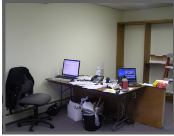
Above: Work continues on the I.T. office

The I.T. (Information Technology) Department today employs six full-time employees who service over 300 personal computers, 26 servers and 300 email accounts at all county offices including the Courthouse, Manor, Prison, Human Services, District Justices, EMA, 911 Center, STAR, Airport, and Library. In the early 80's Bradford County was using word processors in the courts. In 1983 the VAX System, a mainframe computer was purchased and the I.T. Department employed 3 full-time employees. All programs for the Assessment Office, Domestic