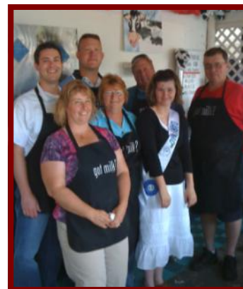
Serving Ice Cream at the Fair