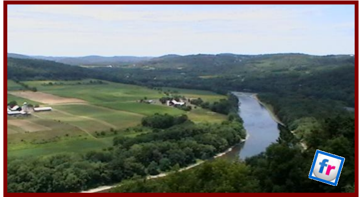
Above: A view of Susquehanna River from the Wyalusing.

kayaks on the river and children fishing on the pond. It was such a great experience and I sincerely appreciated all of the hospitality that was shown to us during these three days. We spoke to private citizens on the street and had interviews with local business owners. Everyone was so friendly and cooperative. We tasted