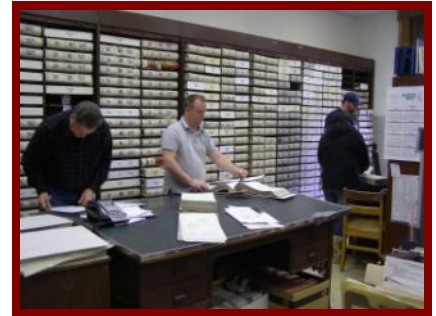
Gas companies employees and public searching deeds

reasons. In an effort to ease some of this congestion, the register and recorder has begun moving records to an online site called Landex . In the beginning there were only