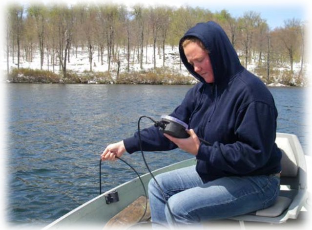
Sunfish Pond, Bradford County

In addition to stream activities, BCCD was also involved in the DEP Statewide Lake Monitoring Program in 2012. Lake assessment was completed on two lakes in Bradford County; Sunfish Pond and Saxe Pond, and on one lake in Susquehanna County; Minkler Lake (aka: Reflection Lake). In-situ field data was collected at two stations on each lake three times throughout the year: Spring, Summer, and Fall. A maximum depth was attained and temperature, pH, DO, and conductivity were recorded at one meter intervals throughout the profile at each station. Water samples for lab analysis (TP, TN, TSS, TDS, and Alkalinity) were collected one meter from the surface and one meter from the bottom. Additional samples were analyzed to gather background information on metals and organics in the event impacts from the Marcellus gas industry are seen. Also, Secchi depth was recorded, and plankton and chlorophyll A samples were collected.