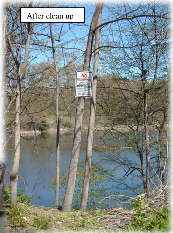
After clean up