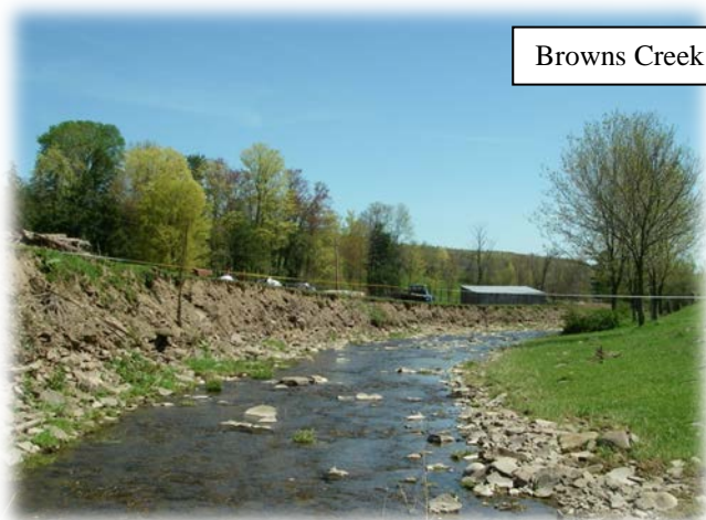
Browns Creek Project- Before & After

A fine example of cooperative pooling of resources went into an extensive agriculture and stream stabilization project on Browns Creek. The Sugar Creek Watershed Association, through a Growing Greener grant contributed $37,380.00. Chesapeake Energy, among other stream initiatives, chipped in $10,000.00. Through the Conservation Innovation Grant (noted independently herein) allocated $16,440.00 in BMP vouchers. $15,480.00 was cost-shared through the Conservation Reserve Enhancement Program, while $73,500.00 came through the NRCS Chesapeake Bay Watershed Initiative. Combined with landowner contributions and decisions, the project greatly improved erosion control and nutrient management by: relocating animal groups; excluding animals from riparian areas and establishing over 14 acres of riparian buffer (encompassing more than 8000 feet of fence); stabilizing 1,300 feet of stream bank; providing stabilized stream crossings; installing roof run-off systems; creating pasture setbacks from ditches; constructing a milkhouse waste system; relocating manure and feed handling areas; and developing and following a Comprehensive Nutrient Management Plan.