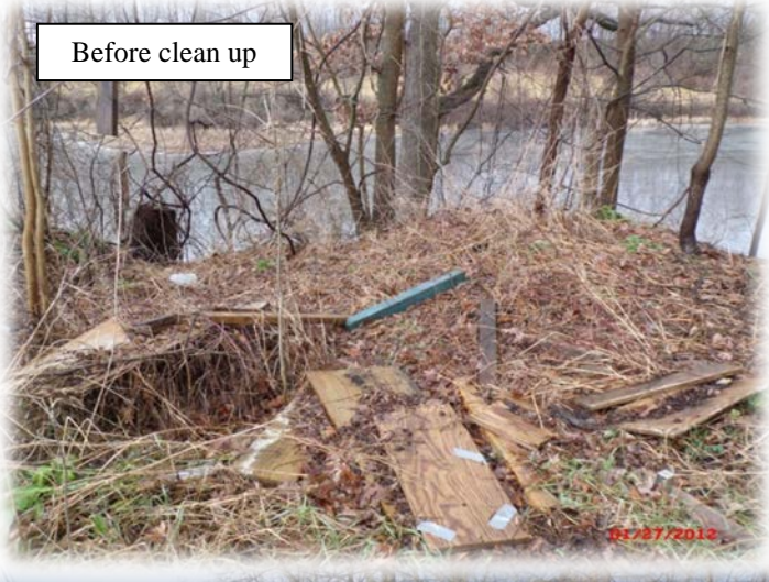
Before clean up